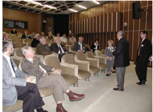
Discussion in the Lecture Hall